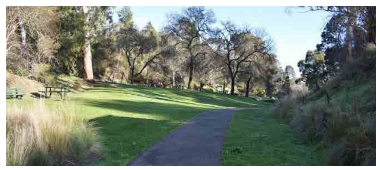
Figure 1: The popular Hepburn Mineral Springs Reserve

Hepburn Shire is in the Central Highlands region of Victoria, approximately 110 kilometres north-west of Melbourne.