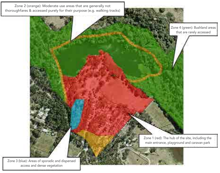
Figure 8: Multiple zones within Jubilee Lake Reserve

Jubilee Lake Reserve is managed in conjunction with DELWP and covers over 37 hectares. Home to the Jubilee Lake Holiday Park, it attracts various community members and groups, and is a camping base for the ChillOut Festival which brings 20,000 visitors to the region annually. In contrast this reserve has bushland areas that are rarely accessed. Figure 8 describes the application of each zones.