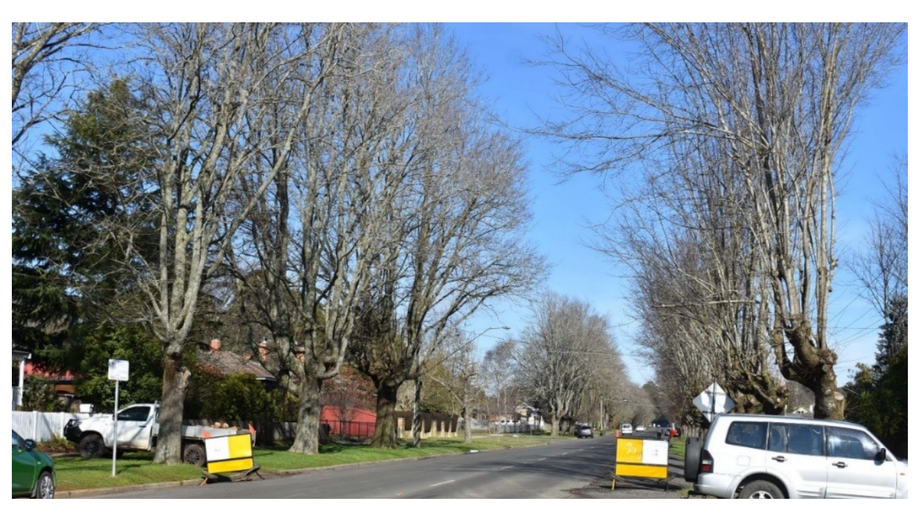
Figure 9: Trentham Avenue of Elms: Future tree planting will consider existing tree and landscape character

Council will manage replacement and infill planting on a five-yearly cycle. This cycle will be based on a ward approach and outlined in the associated Tree Planting Plan 2021 - 2026.