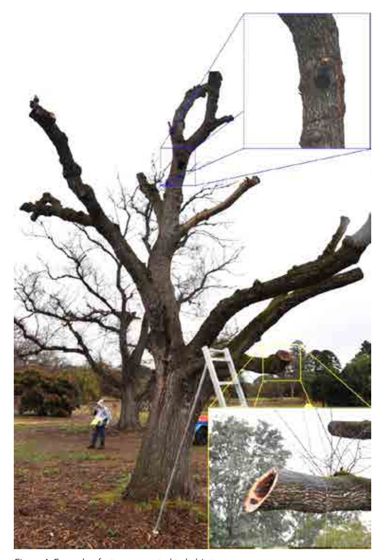
Figure 4: Example of a tree converted to habitat