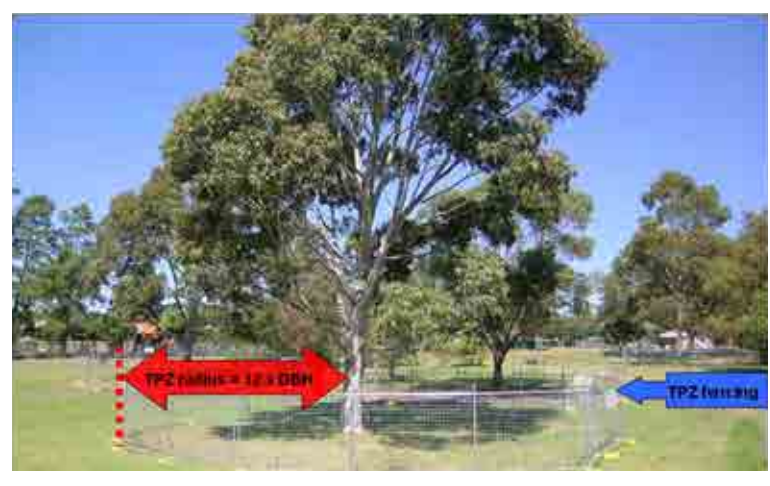
Figure 3: TPZ fencing is erected around retained trees prior to site works