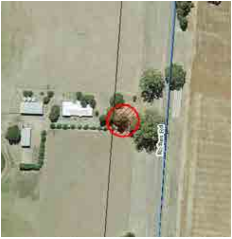
Figure 6: Significant tree (Eucalyptus viminalis) outside 45 Rothes Road, Little Hampton