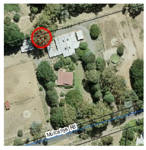
Figure 5: Significant tree (Eucalyptus obliqua) within 60 Mulcaheys Road, Trentham