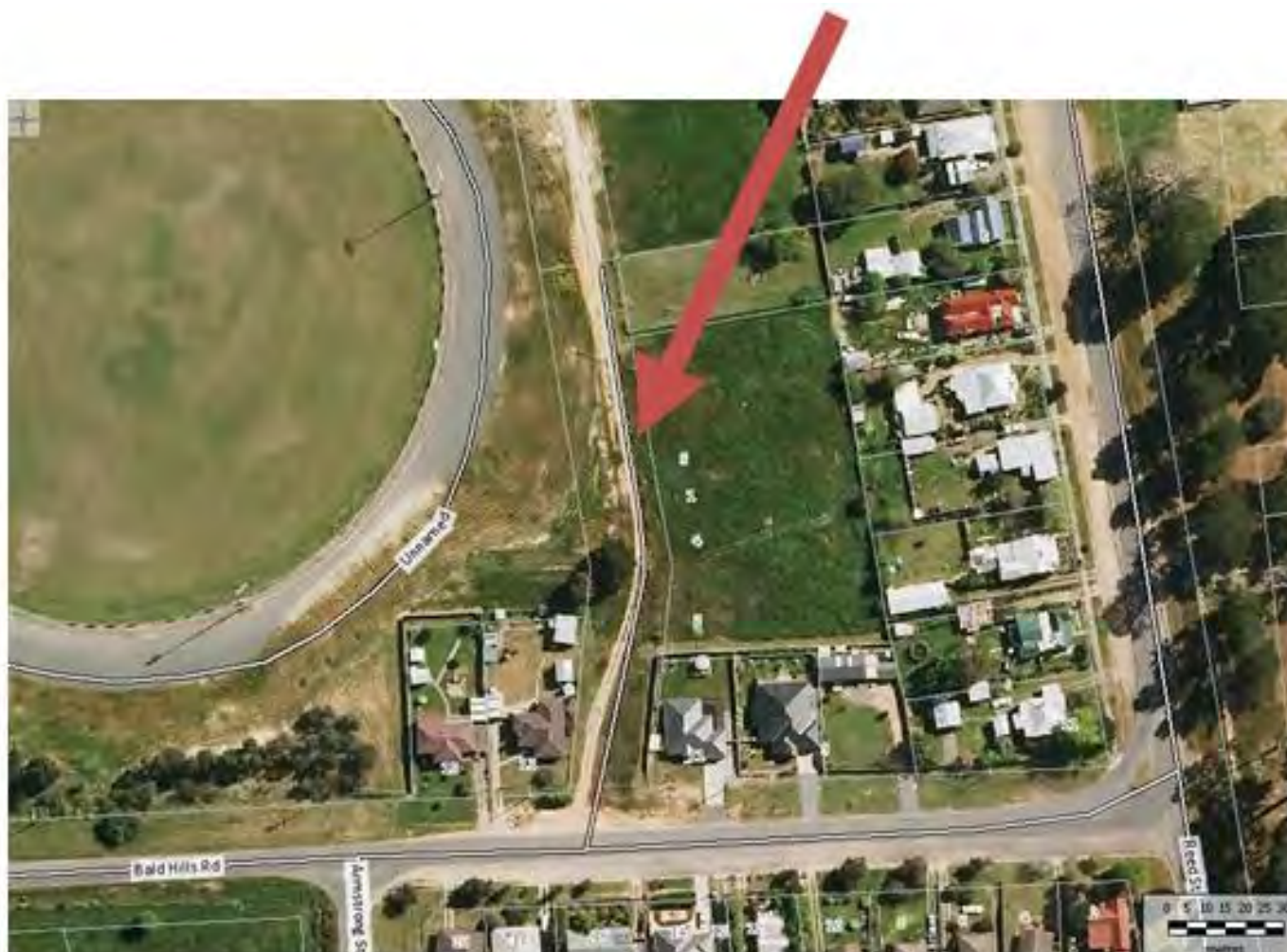
Unnamed Road off Bald Hills Road, Creswick