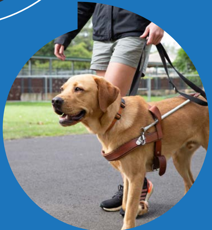
Photo – Guide Dogs