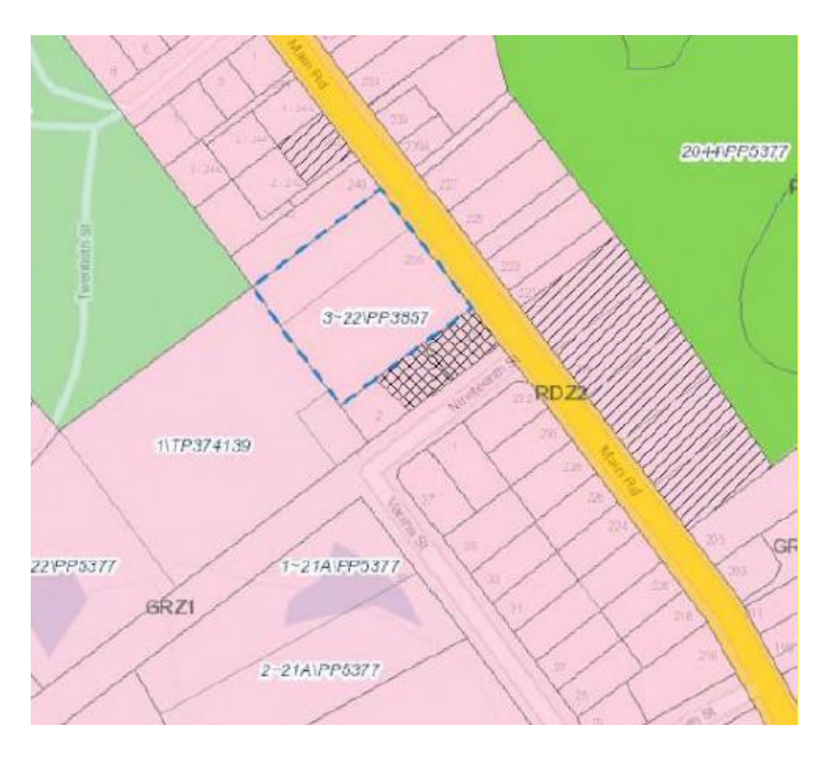
Figure 1: Site subject of the amendment

The amendment applies to the Old Hepburn Hotel at 236 Main Road Hepburn Springs, shown in Figure 1 below.