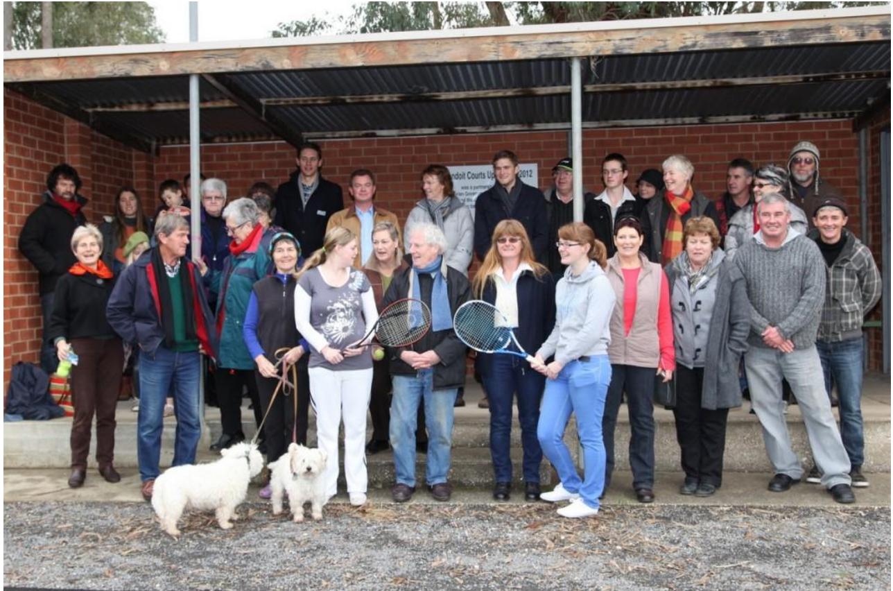
Celebrating the opening of the Yandoit Tennis Court, July 2012.