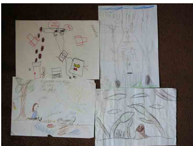
Illustrations by Drummond Primary School children.